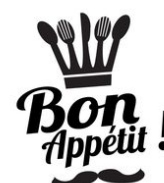
Restaurante El Muelle de Arriate