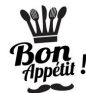
Restaurante El Muelle de Arriate